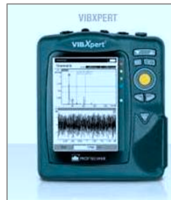
Industry accepted analysis equipment